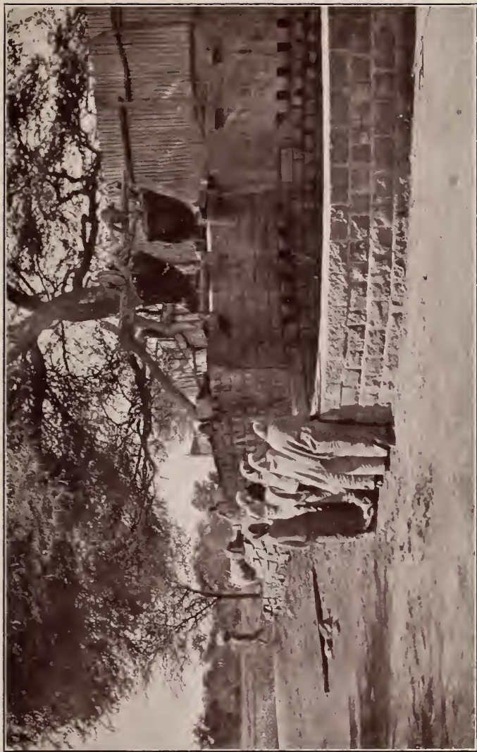
One of the nine great wells at Mukti. The water supply has never failed. Bullocks pull up the water in the skin buckets.